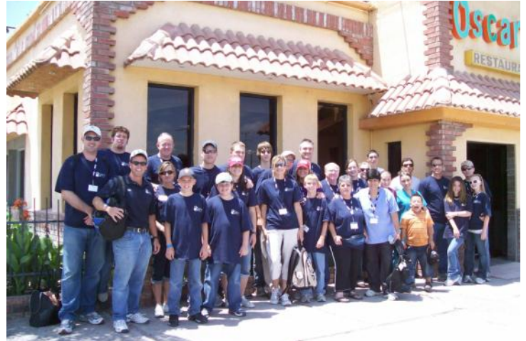
CHIA group shot in front of the famous Oscars in Villa Ahumada Mexico this August